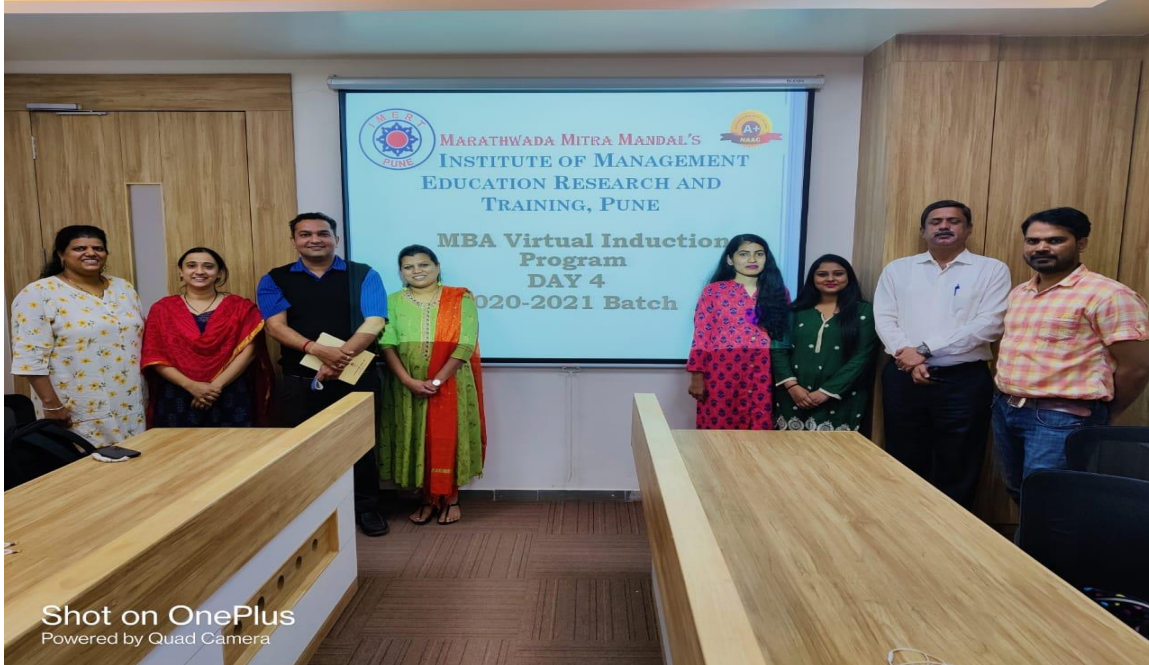
Shot on OnePlus Powered by Quad Camera