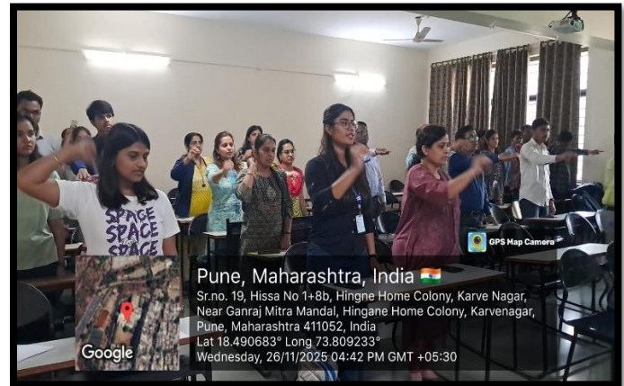
Pune, Maharashtra, India Sr.no. 19, Hissa No 1+8b, Hingne Home Colony, Karve Nagar, Near Ganraj Mitra Mandal, Hingane Home Colony, Karvenagar, Pune, Maharashtra 411052, India Lat 18.490683° Long 73.809233° Wednesday, 26/11/2025 04:42 PM GMT +05:30