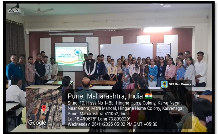
Pune, Maharashtra, India Sr.no. 19, Hissa No 1+8b, Hingne Home Colony, Karve Nagar, Near Ganraj Mitra Mandal, Hingane Home Colony, Karvenagar, Pune, Maharashtra 411052, India Lat 18.490675° Long 73.809229° Wednesday, 26/11/2025 05:02 PM GMT +05:30