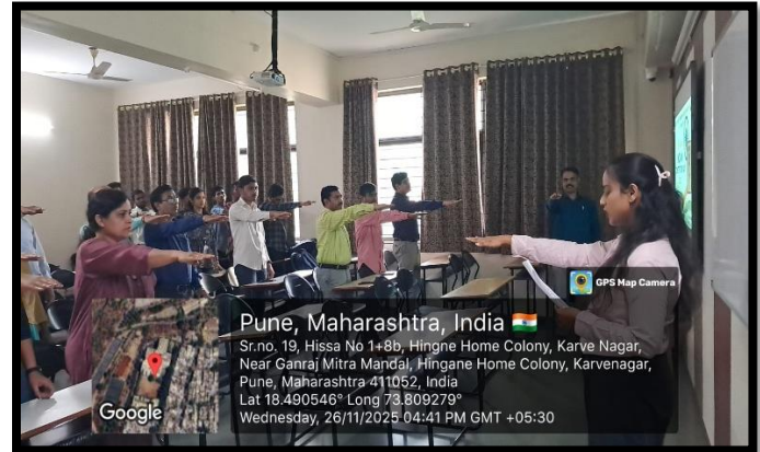
Pune, Maharashtra, India Sr.no. 19, Hissa No 1+8b, Hingne Home Colony, Karve Nagar, Near Ganraj Mitra Mandal, Hingane Home Colony, Karvenagar, Pune, Maharashtra 411052, India Lat 18.490546° Long 73.809279° Wednesday, 26/11/2025 04:41 PM GMT +05:30