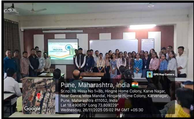
Pune, Maharashtra, India Sr.no. 19, Hissa No 1+8b, Hingne Home Colony, Karve Nagar, Near Ganraj Mitra Mandal, Hingane Home Colony, Karvenagar, Pune, Maharashtra 411052, India Lat 18.490675° Long 73.809229° Wednesday, 26/11/2025 05:02 PM GMT +05:30