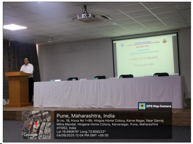
Pune, Maharashtra, India Sr.no. 19, Hissa No 1+8b, Hingne Home Colony, Karve Nagar, Near Ganraj Mitra Mandal, Hingane Home Colony, Karvenagar, Pune, Maharashtra 411052, India Lat 18.490676° Long 73.809223° 04/09/2025 12:04 PM GMT +05:30