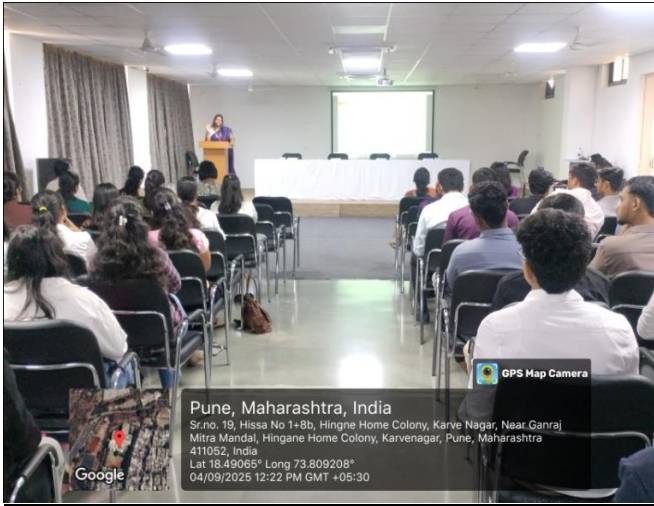
Pune, Maharashtra, India Sr.no. 19, Hissa No 1+8b, Hingne Home Colony, Karve Nagar, Near Ganraj Mitra Mandal, Hingane Home Colony, Karvenagar, Pune, Maharashtra 411052, India Lat 18.49065° Long 73.809208° 04/09/2025 12:22 PM GMT +05:30